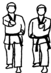
3C. DOUBLE PUNCH

14. Slide the left foot into left tiger stance, left palm block.